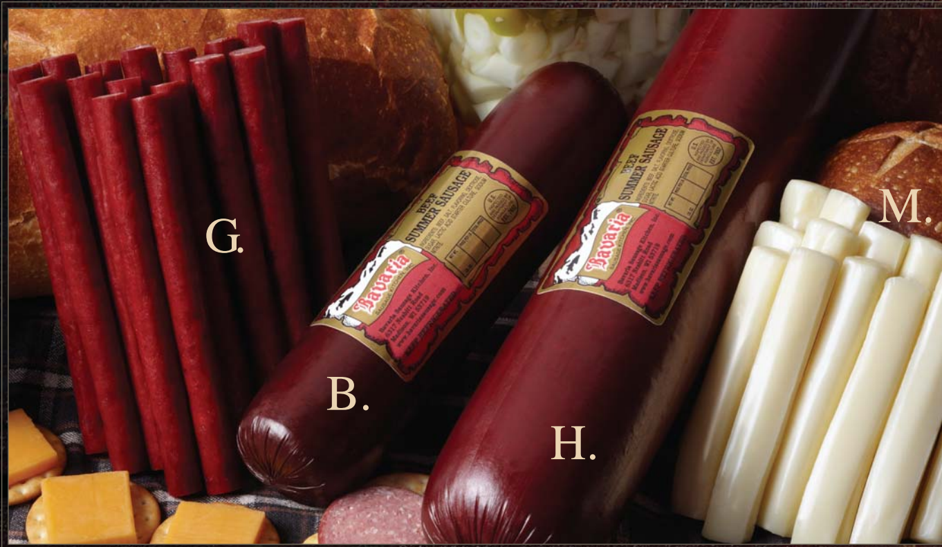
B. 16 oz. Gourmet Beef Sausage G. 2.5 lbs. Beef Sticks H. 44 oz. Gourmet Beef Sausage M. 24 oz. String Cheese